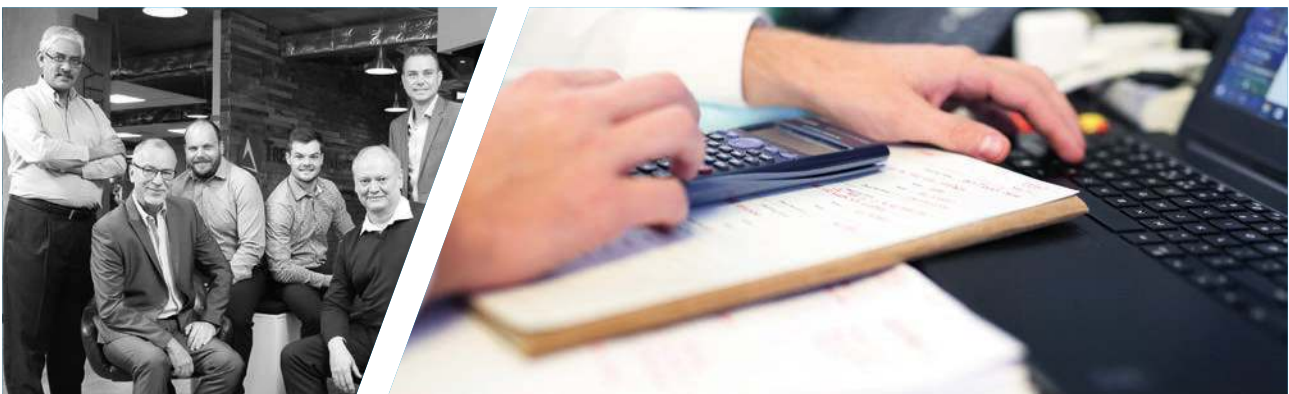
TreasuryONE Dealing Team