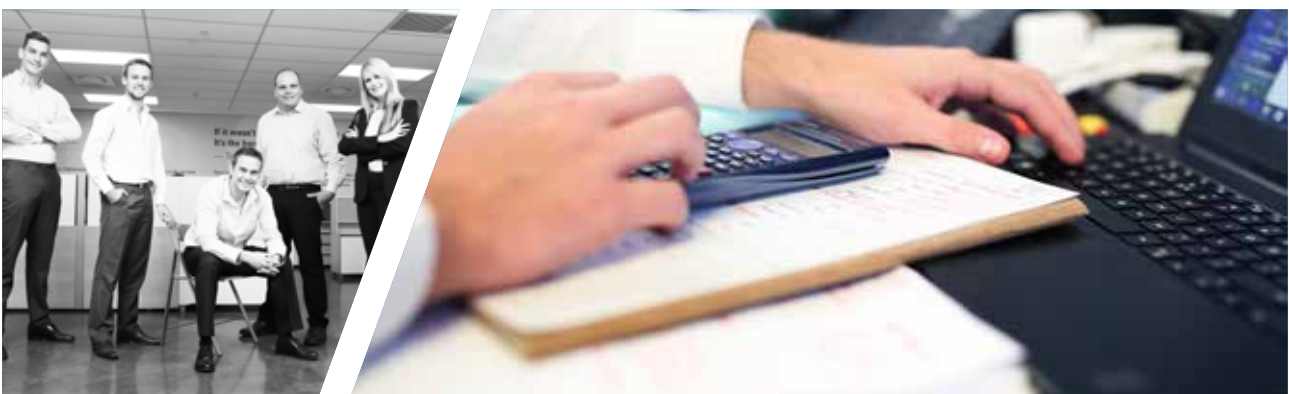
TreasuryONE Dealing Team